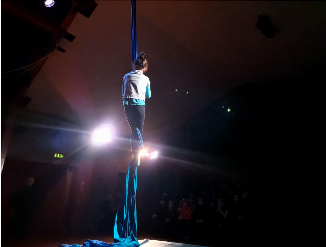
Midi-Youth Aerial Class participant performing for friends and family at Skylight, December 2021

"This was so emotional for me to watch, they're back! She went in so nervous that she was going to mess up and she walked out filled with all of the confidence she lost over lockdown. Skylight Circus Arts are amazing and I'm so grateful for everything they do. The kids were awesome!"