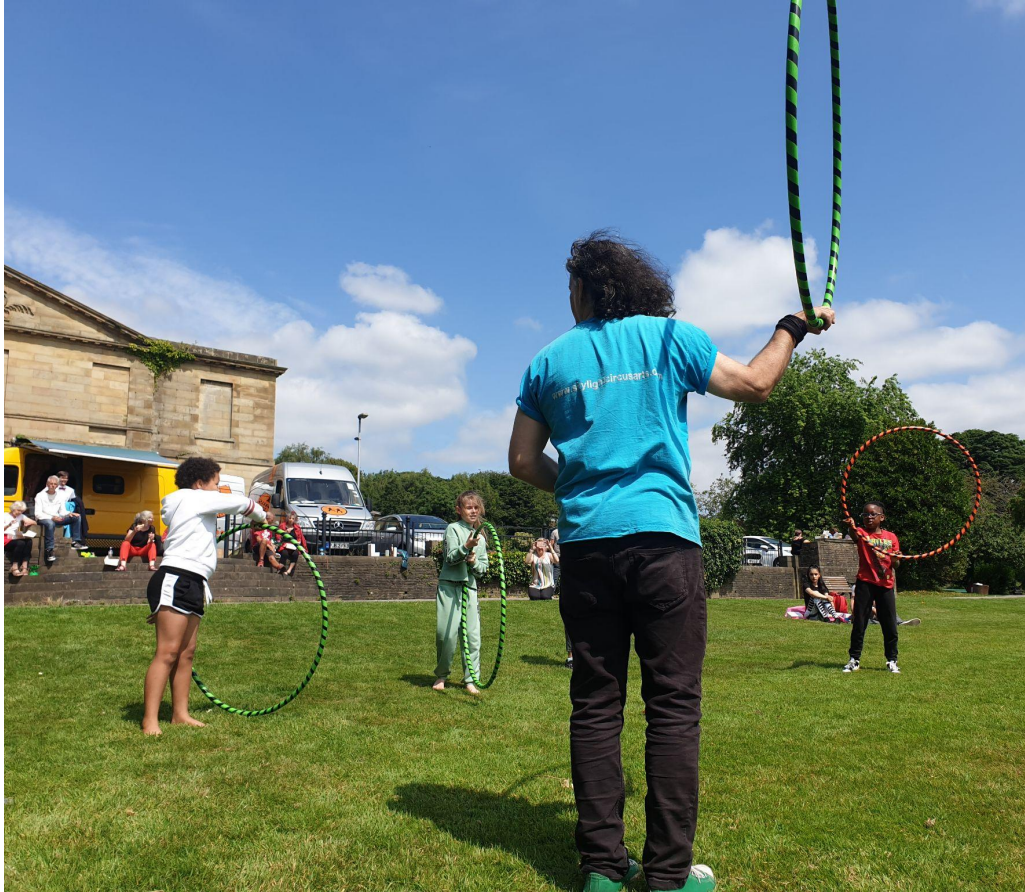
Skylight Team Member and Midi Youth Circus participants at 'Picnic In The Park,' August 2021