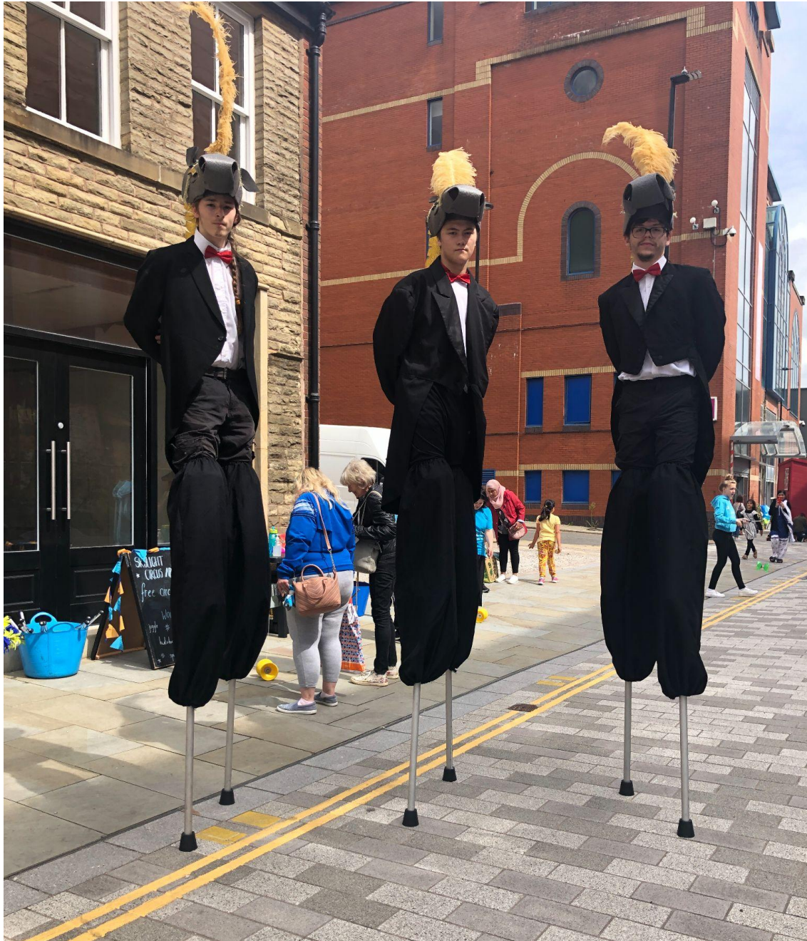
'Horses' standby at 'Cap & Dove' Rochdale Feel Good pop up, August 2021