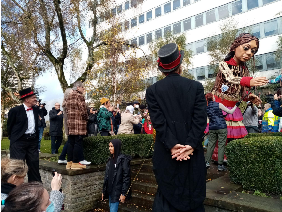
Skylight stilt walkers entertain the crowds with Little Amal, November 2021