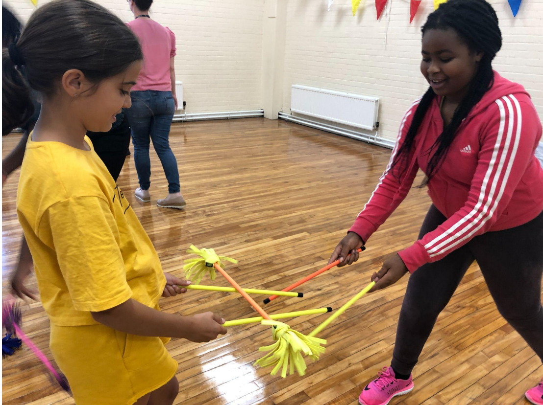
Participants at Skylight at an during outreach 'Have-a-Go' session

"The staff are so friendly & made us all feel at ease no one felt left out I genuinely enjoyed every minute of it"