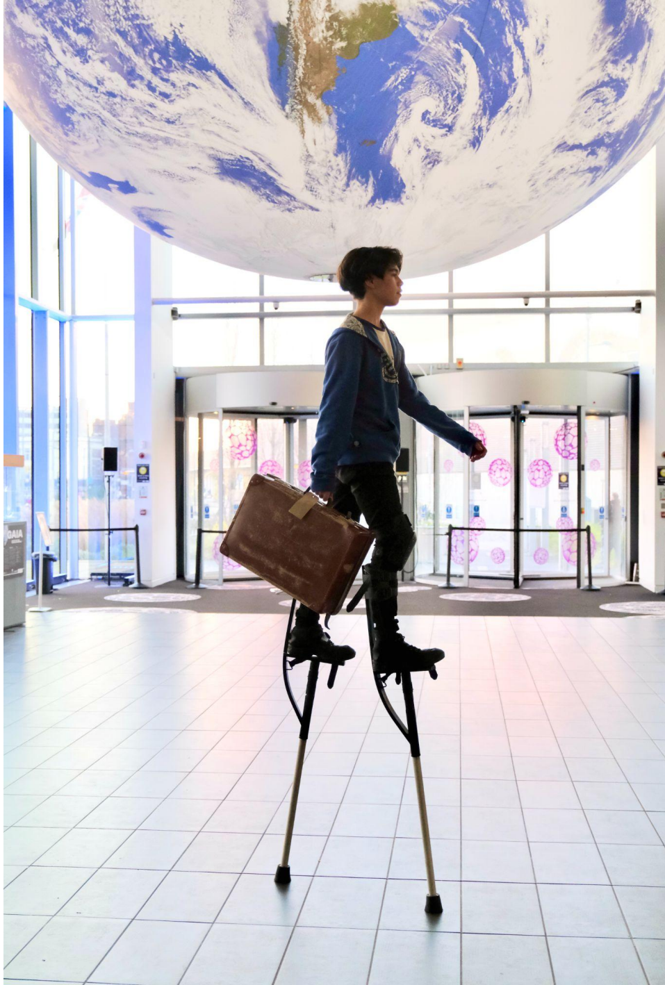
'Circus Globe' participant performs under 'Gaia' installation, Dec 2021