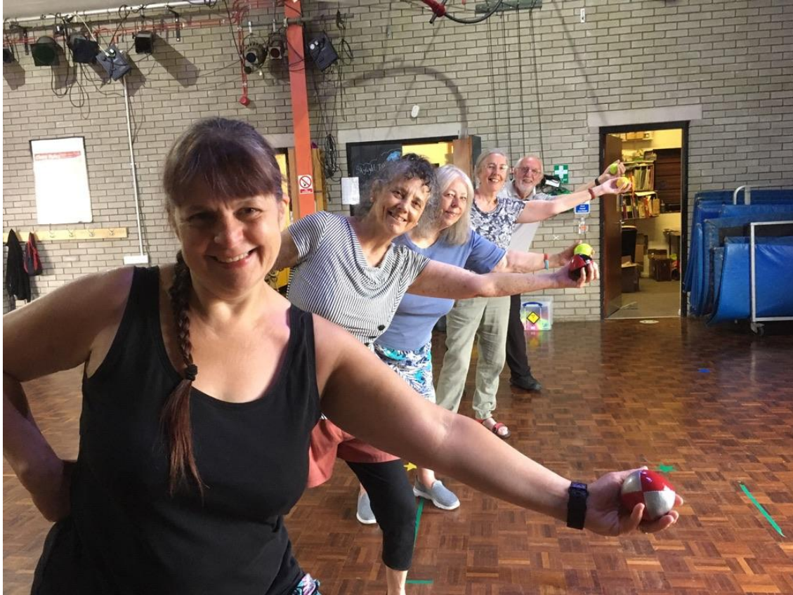
Silver Circus 'Can Droppies' troupe rehearsing for a show, July 2021

"It was great to see us all on stage at the Lowry!"