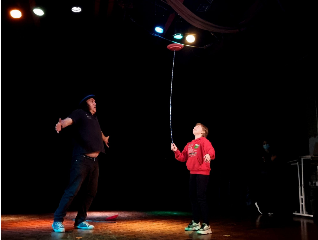
Skylight team member and participant wowing the audience at Skylight's Youth Circus Christmas Show, December 2021